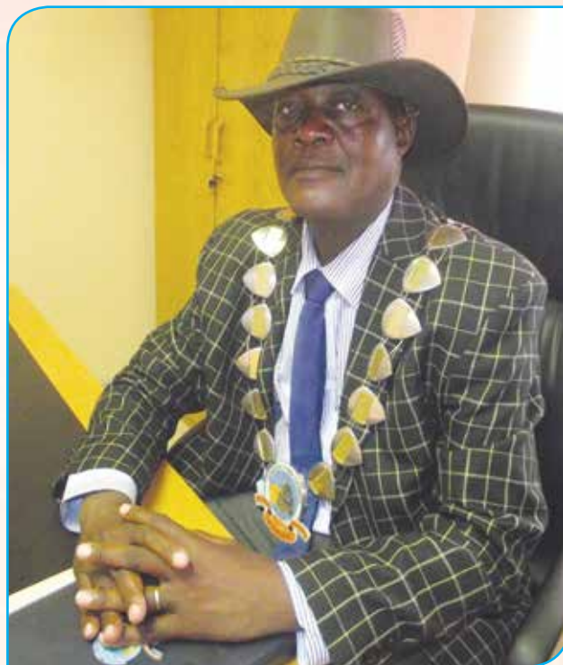
His Worship Hon. Mbockoma Mungandjera Mayor of Oshikuku

In conclusion, I hereby assure you that the Council of Oshikuku remains committed to fulfil its mandate, retain existing businesses and attract investors in order to grow the local economy.