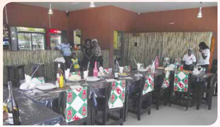
Restaurant: Monday - Saturday 10h00 to 02h00 Sunday 10h00 to 23h00 Daily exciting menu & they do catering too. Restaurant has a capacity of 30 persons (seats)