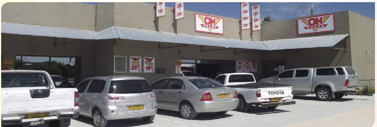
Supermarket opens from 08h00 - 20h00 pm

Contact details: Tel +264 65 254602 Fax +264 65 254513 Cell +264 812707 330